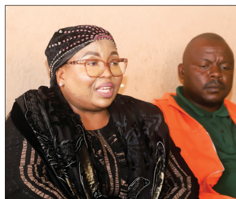
SDM Executive Mayor, Cllr Minah Bahula, comforting the families of victims who passed away in a tragic taxi accident.