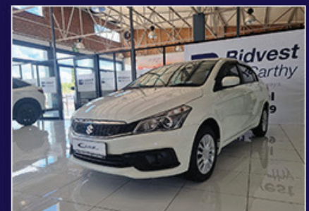
2025 SUZUKI CIAZ 1.5 GL A/T