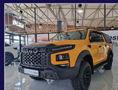
2024 JAC T9 A/T SUPER LUX 4x4