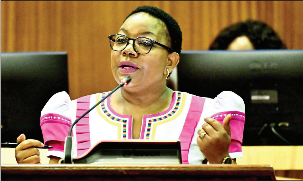
MEC for Education in Limpopo, Mavhungu Lerule-Ramakhanya, emphasized that the 2025/2026 budget will focus on accelerating schools' infrastructure development for a conducive learning environment and essential academic success.