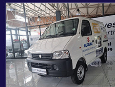
2024 SUZUKI EECO 1.2 P/V M/T