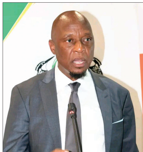
EMLM Mayor, Cllr David Tladi, addressing the traditional leaders during the joint consultation for the 2025/2026 Draft Integrated Development Plan (IDP) and Budget, held at the EMLM Municipal Chamber in Groblersdal.

Makua indicated that the collaborative effort between the local municipality and traditional leaders does not only highlights the municipality's dedication to engaging with all stakeholders, however, it also sets a precedent for future initiatives aimed at creating a