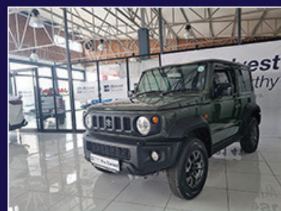
2020 SUZUKI JIMNY 1.5 GLX A/T