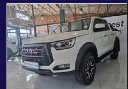
2024 JAC T8 M/T LUX 4x2