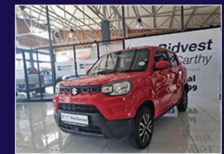
2023 SUZUKI S-PRESSO 1.0 GL+ M/T