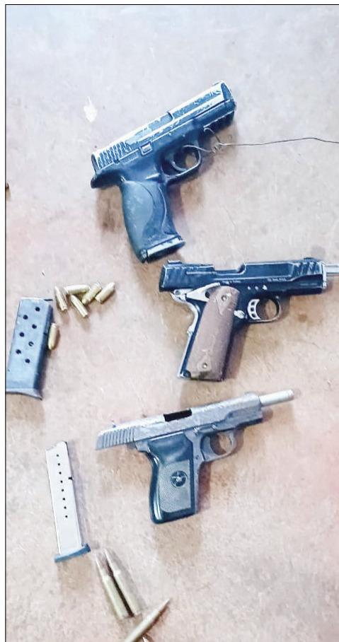
The firearms and ammunition recovered in possession of the suspects during their arrests.