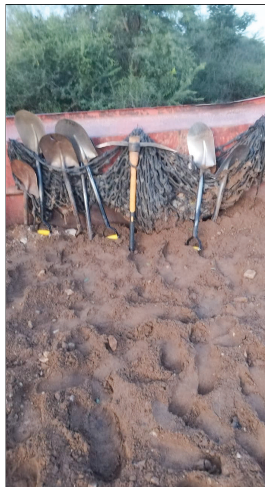
Operation Vala Umgodi continues to crack down on illegal sand miners in various parts of the province.

NEBO/APEL - Operation Vala Umgodi conducted in Nebo and Apel led to the arrest of four suspects aged between 26 and 53 for illegal mining of sand on 2 April.