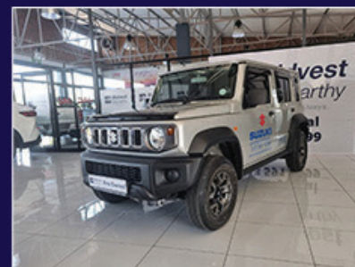
2024 SUZUKI JIMNY 1.5 GL5DR M/T