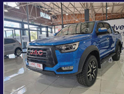
2025 JAC T8 M/T LUX 4x4