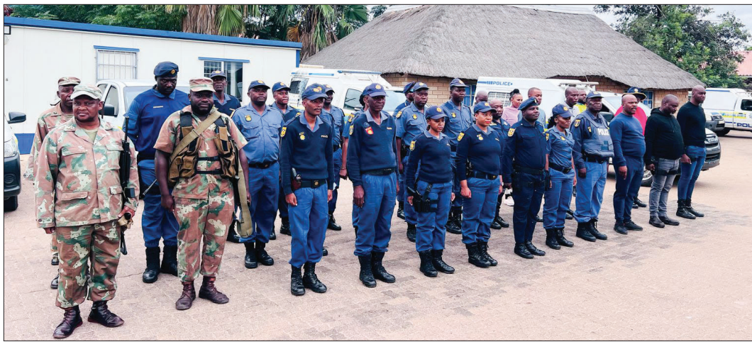
Law enforcement members on parade ahead of Shanela operations that were conducted across the province from 30 March until 6 April.

LIMPOPO - The high density South African Police Service (SAPS) Shanela operations conducted across the five districts of Limpopo province from 30 March until 6 April resulted in the apprehension of a total number of 330 suspects.