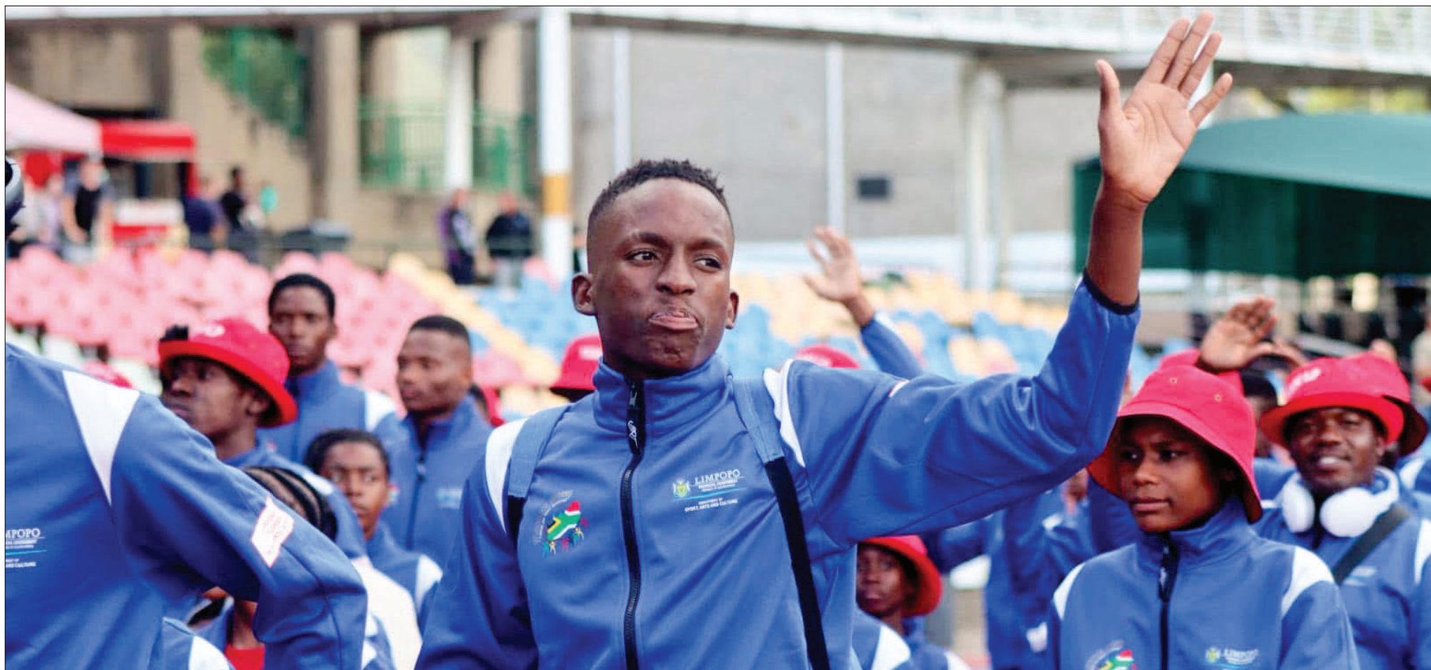
Some of athletes in Free state province.