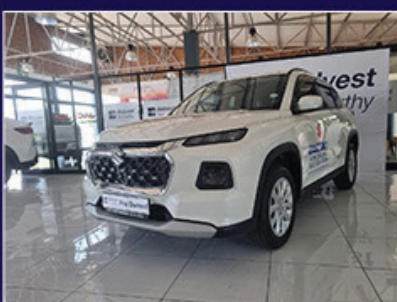
2025 SUZUKI GRAND VITARA 1.5 GL A/T