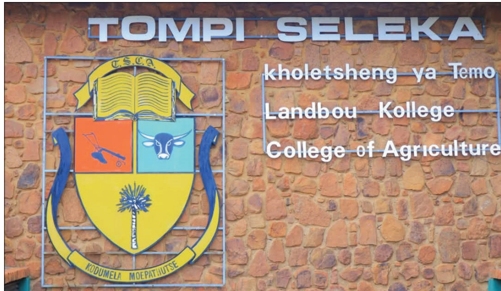
The Democratic Alliance in Limpopo is calling for an investigation into contracts of Tompi Seleka Agricultural College EPWP workers.

PHETWANE - The Democratic Alliance (DA) in Limpopo seeks the departments of Agriculture and Rural Development and Public Works, Roads and Infrastructure to investigate complaints by Extended Public Works Programme workers attached to Tompi Seleka Agricultural College concerning the alleged coercion of the workers into accepting altered contract terms.